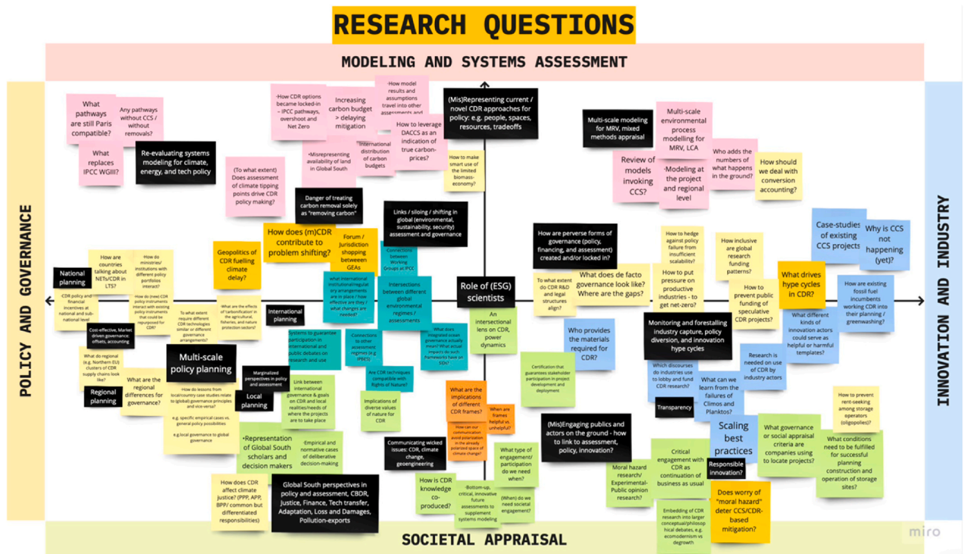
Fig. 3. Research questions.

The mapping framework is adapted from Boettcher et al. (2021) and Sovacool et al. (2023). It spans four intersecting areas: Modeling and systems assessment , Societal appraisal , Policy , and Innovation and Industry . The intersections between each major area (the six grey arrows) posit how activities in each area might reinforce or contest activities in the other three. The actors, activities and issues in boxes are intended as non-exhaustive, illustrative examples as a basis for mapping the wider range of actors, activities and issues relevant in each of quadrants.